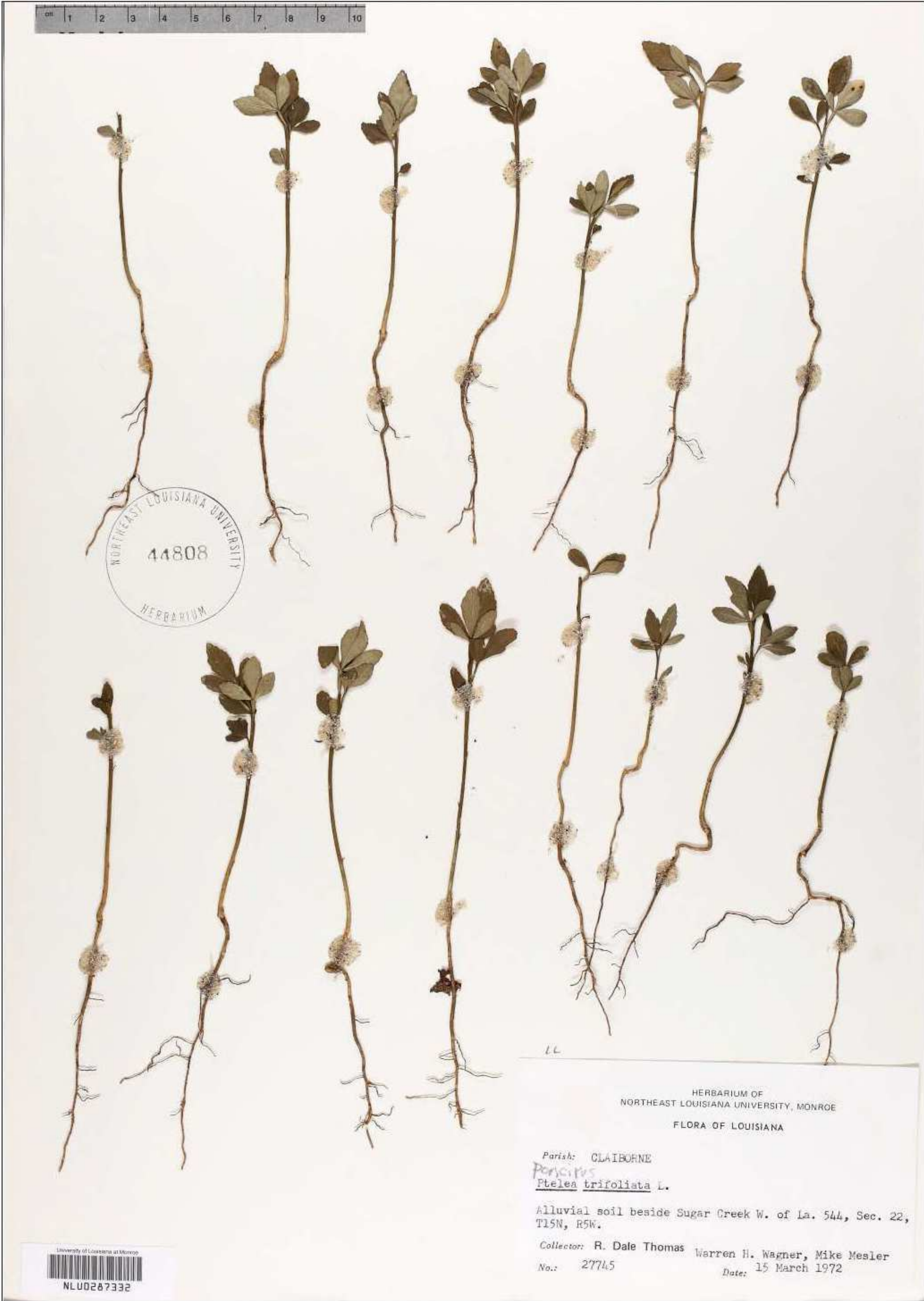
Figure 4. Seedlings of trifoliolate orange, probably first year.